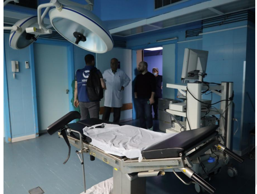
Inside the Latakia Hospital (northwestern Syria) run by our partner HIHFAD

Security: Country Director evacuated. Danger from missile debris. Continued access by air is not secured.