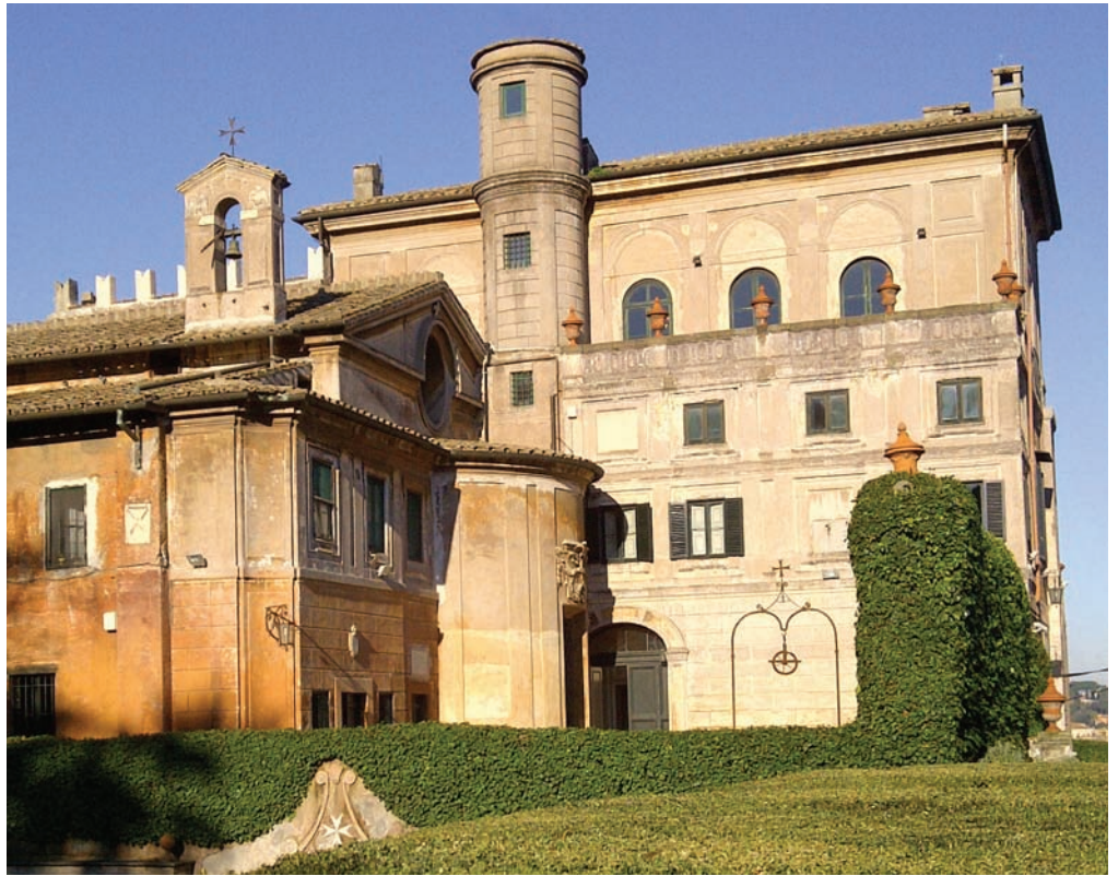
Grand Magistral Villa