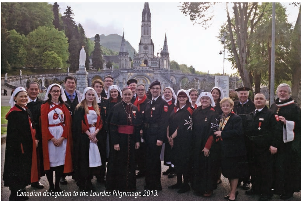
Canadian delegation to the Lourdes Pilgrimage 2013.