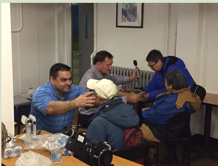
The Eye Clinic in Vancouver

Published by the Canadian Association of the Sovereign Military Hospitaller Order of St. John of Jerusalem of Rhodes and of Malta