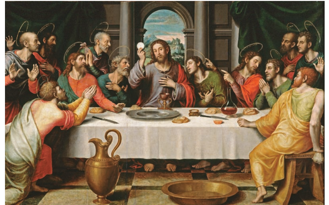
The Last Supper by Joan de Joanes, Valencia, Spain, circa 1550

The Most Reverend William Edward Lori, STD was installed as Archbishop of Baltimore on May 16, 2012. He is chairman of the Ad Hoc Committee on Religious Liberty, advocating for the rights of Catholic institutions. 4